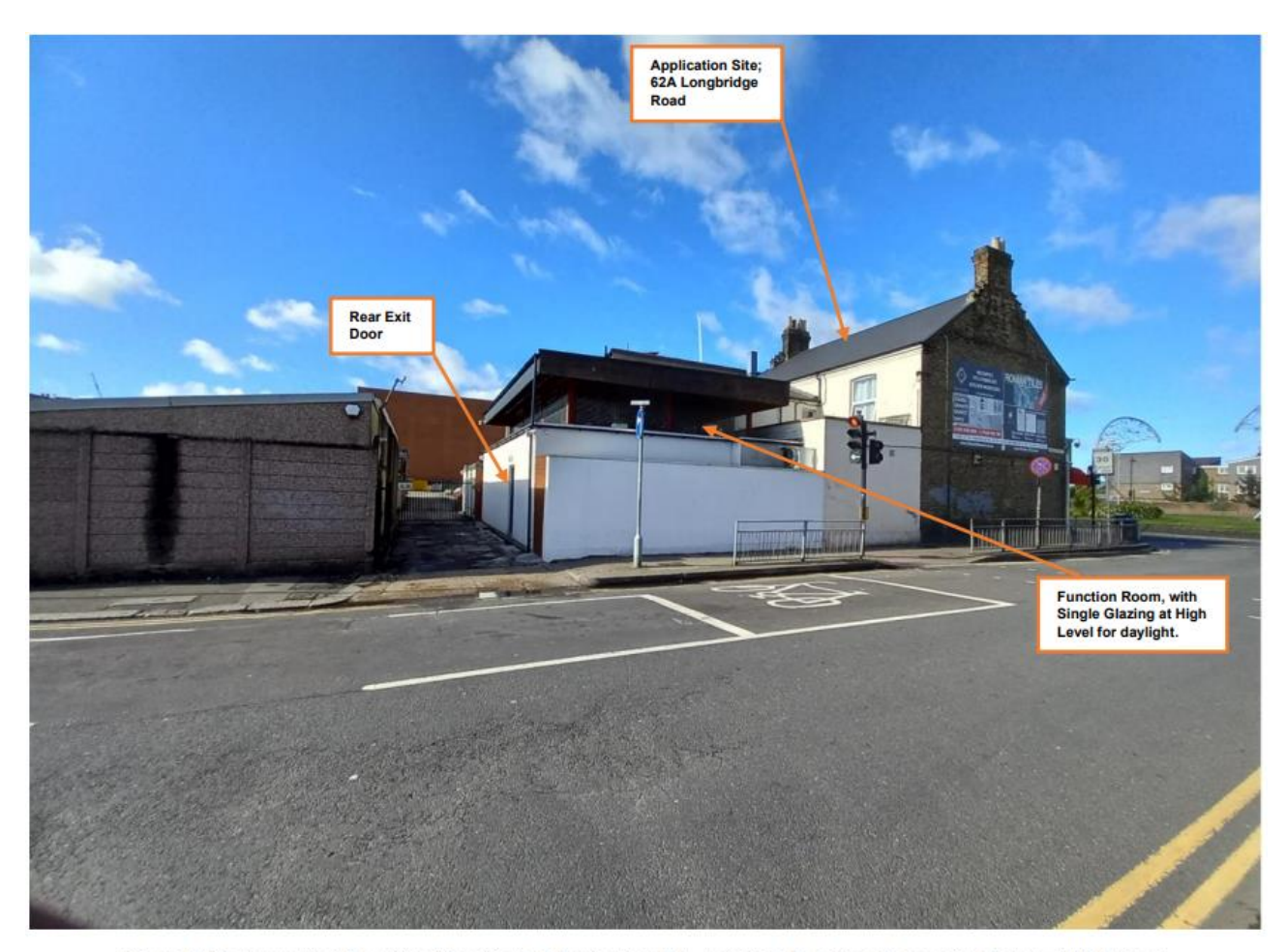
Figure 3: Photographic View (Side Elevation) of Application Site depicting Function Room with Glazing at High Level