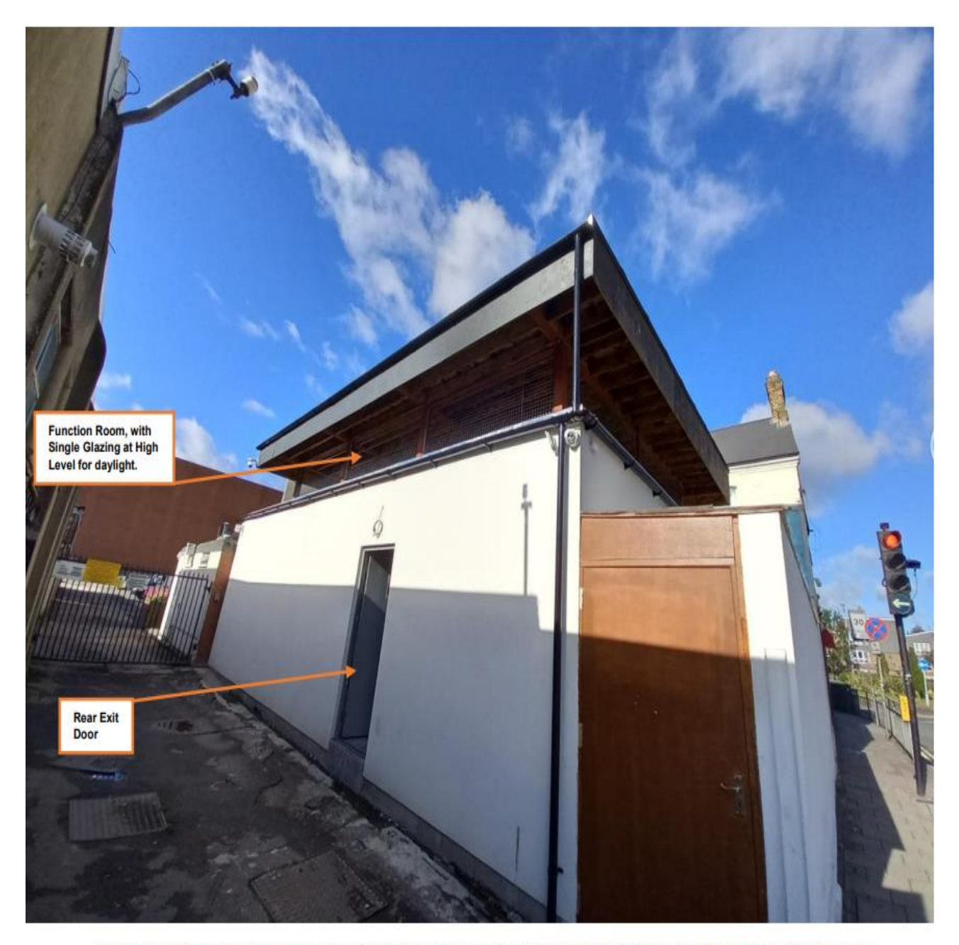
Figure 4: Photographic View (Rear Elevation) of Application Site depicting Function Room with Glazing at High Level