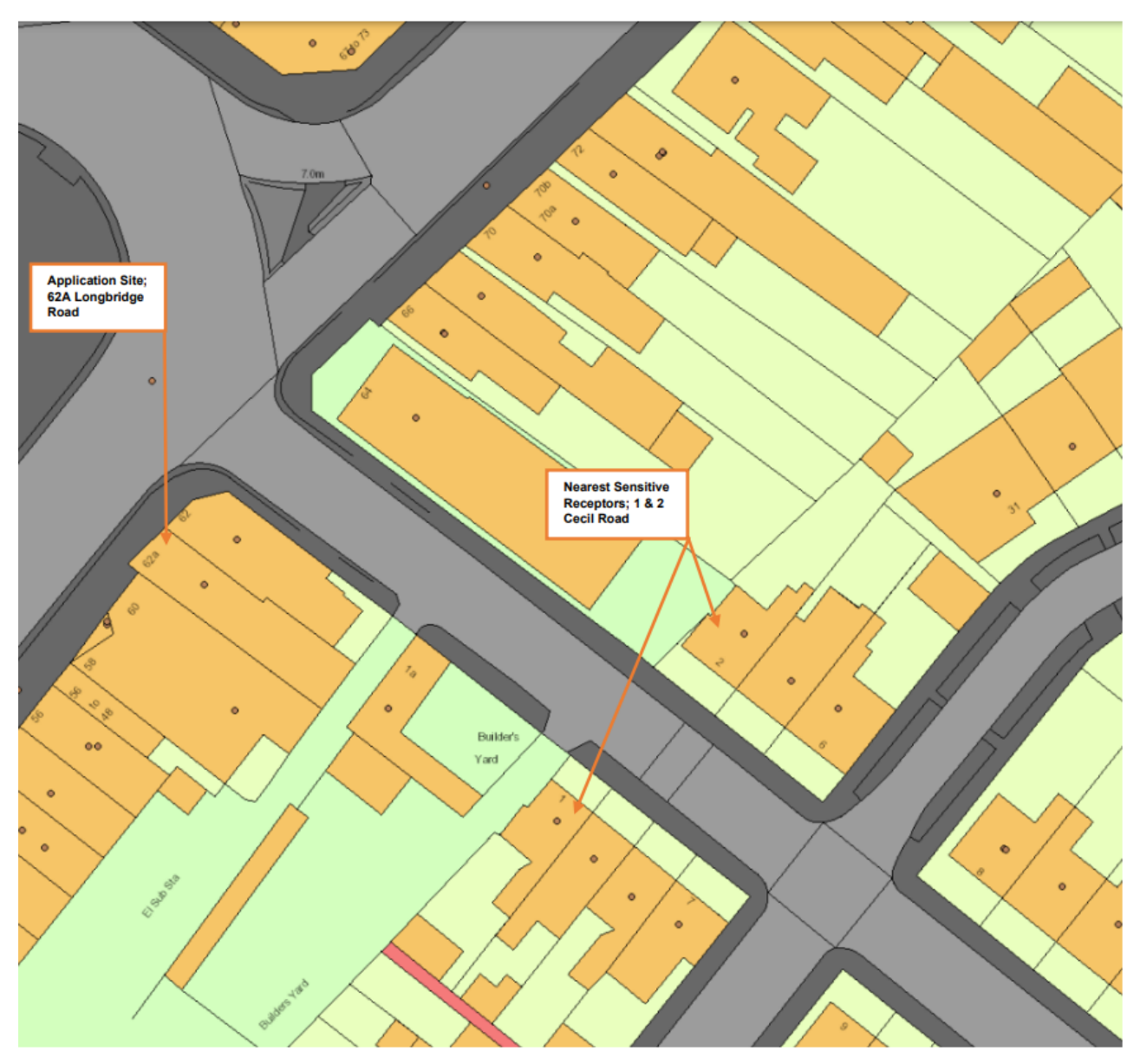
Figure 1: Map depicting Application Site & Nearest Sensitive Receptors